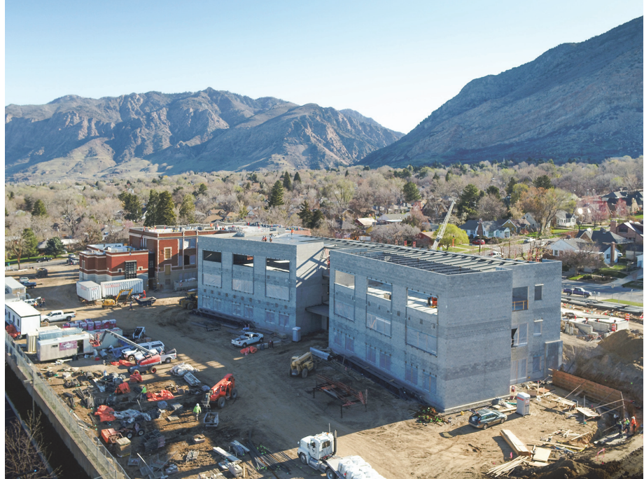
Figure 2-4 The new three-story addition currently under construction at Polk Elementary School in Ogden. In the background, work on the seismic retrofit of the original school building, from 1926, is underway.