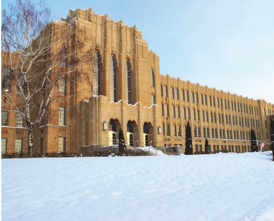
Figure 2-2 The renovation and retrofit of historic Ogden High School was completed in December 2012.