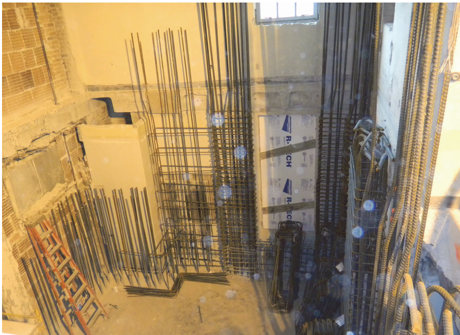
Figure 2-3 Steel reinforcement placed during the retrofit of Ogden High School.