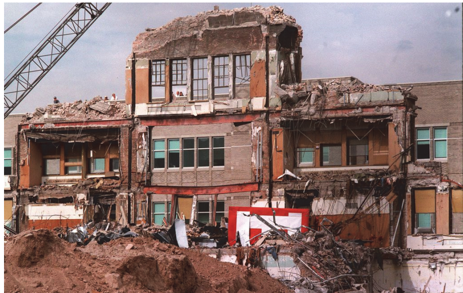
Figure 2-1 Demolition of unreinforced masonry construction at East High School, Salt Lake City in 1996.

In some cases, districts have decided to demolish and replace URM school buildings (Figure 2-1), whereas in other cases districts have opted to retrofit URM school buildings. Ogden High School is an Art Deco building constructed in 1937 and is listed on the National Register of Historic Places. It was retrofitted and expanded in December 2012 (Figure 2-2 and Figure 2-3).